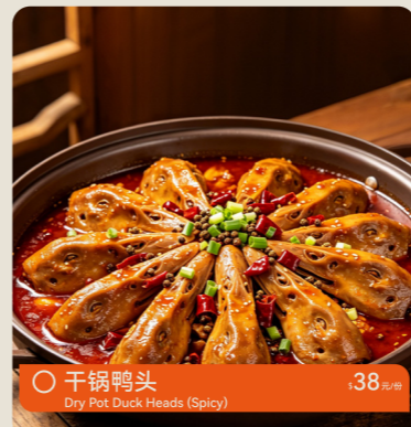
干锅鸭头 $38元/份 Dry Pot Duck Heads (Spicy)