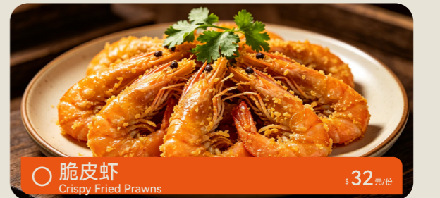
脆皮虾 $32元/份 Crispy Fried Prawns