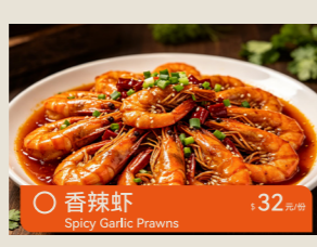
香辣虾 $32元/份 Spicy Garlic Prawns