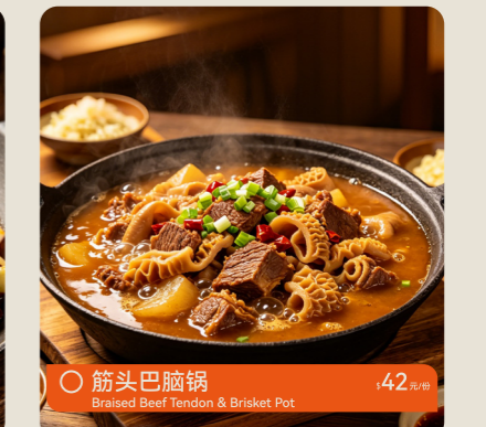
筋头巴脑锅 $42元/份 Braised Beef Tendon & Brisket Pot