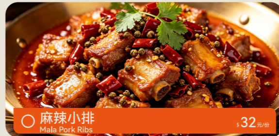
麻辣小排 $32元/份 Mala Pork Ribs