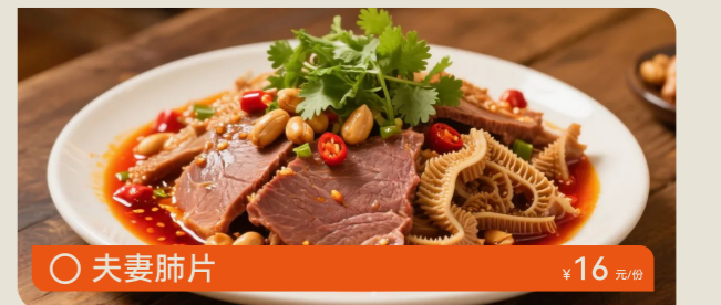
夫妻肺片 $16元/份 Braised Beef Tendon & Brisket Pot