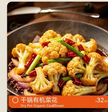
干锅有机菜花 $32元/份 Dry Pot Organic Cauliflower