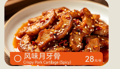
风味月牙骨 $28元/份 Crispy Pork Cartilage (Spicy)