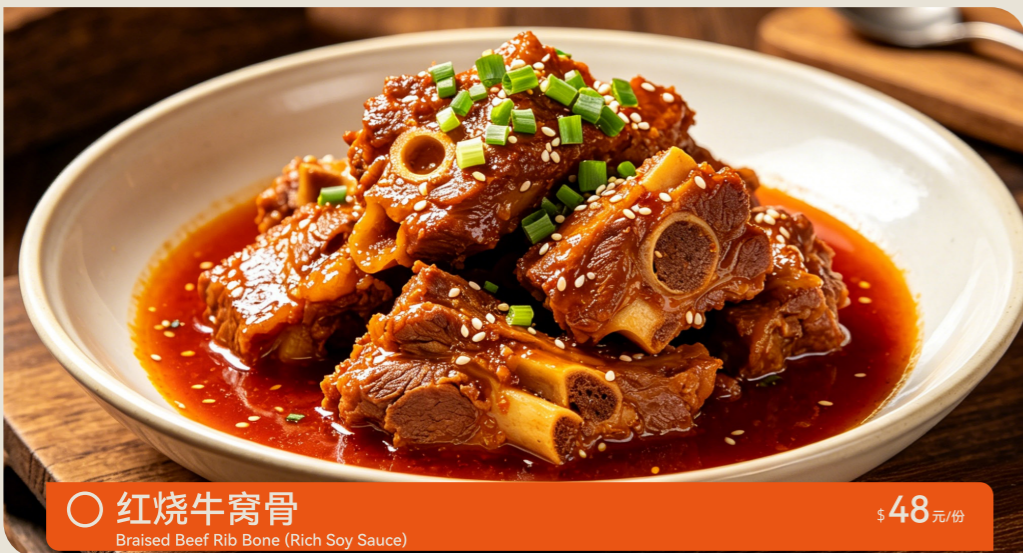
红烧牛窝骨 $48元/份 Braised Beef Rib Bone (Rich Soy Sauce)

TASTE THE FRESHNESS FROM OUR GARDEN TO YOUR WOK