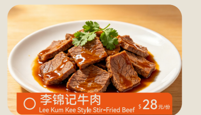
李锦记牛肉 $28元/份 Lee Kum Kee Style Stir-Fried Beef