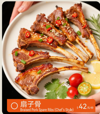
扇子骨 $42元/份 Braised Pork Spare Ribs (Chef's Style)