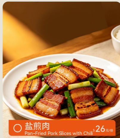
盐煎肉 $26元/份 Pan-Fried Pork Slices with Chili