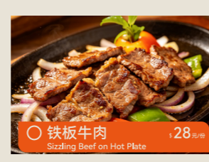
铁板牛肉 $28元/份 Sizzling Beef on Hot Plate