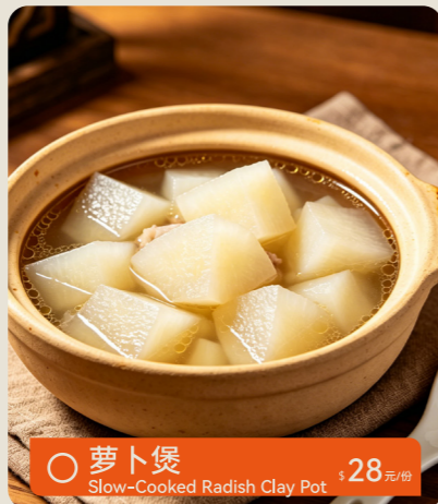
萝卜煲 $28元/份 Slow-Cooked Radish Clay Pot