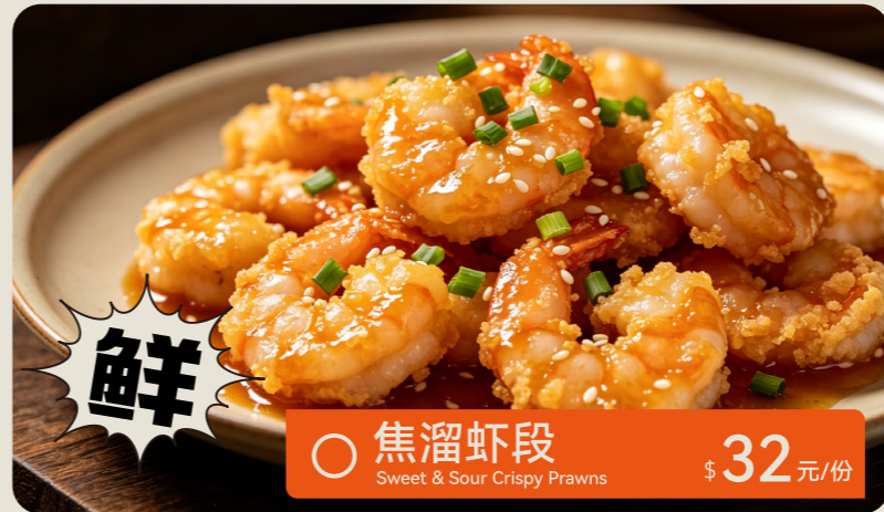
鲜 焦溜虾段 $32元/份 Sweet & Sour Crispy Prawns