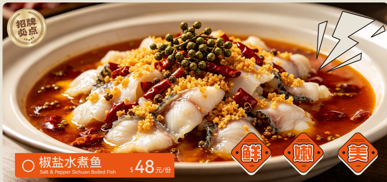
招牌必点 椒盐水煮鱼 $48元/份 Salt & Pepper Sichuan Boiled Fish

在这里，我们用心为您呈现每一道中式美食，让您在他乡的生活中，找到一丝烟火气息找到熟悉味蕾的盛宴