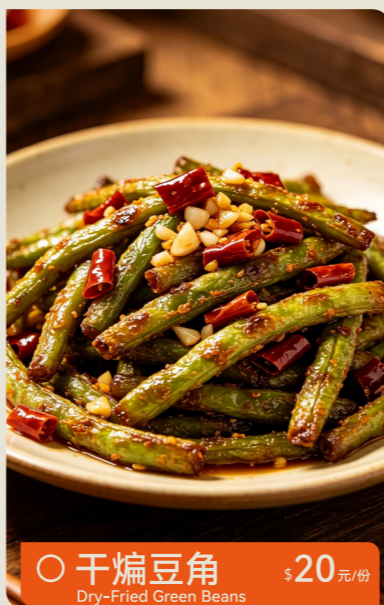
干煸豆角 $20元/份 Dry-Fried Green Beans

TASTE THE FRESHNESS FROM OUR GARDEN TO YOUR WOK