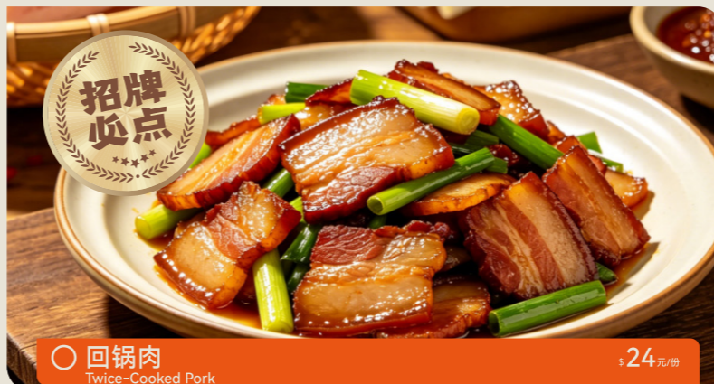
招牌必点 回锅肉 $24元/份 Twice-Cooked Pork

TASTE THE FRESHNESS FROM OUR GARDEN TO YOUR WOK