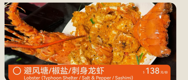
避风塘/椒盐/刺身龙虾 $138元/份 Lobster (Typhoon Shelter / Salt & Pepper / Sashimi)