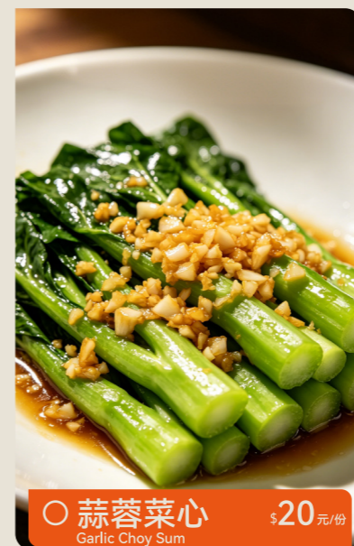
蒜蓉菜心 $20元/份 Garlic Choy Sum