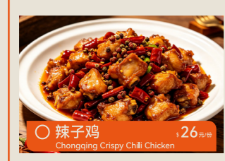
辣子鸡 $26元/份 Chongqing Crispy Chili Chicken